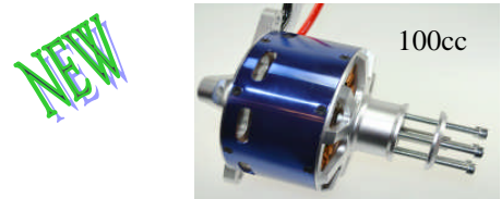
#33890 100cc Dymond Tomcat $557.14

Up to 3000 Watt, 200KV high torque, 10s, 20x12 to 22x11 Props, 100A HV ESC, 65A continuous, Weight 680g, 10mm Shaft. Use 3000 – 6200mah batteries. 8-10s Li-Po