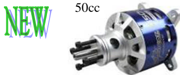
#33889 50cc Dymond Tomcat $299.95